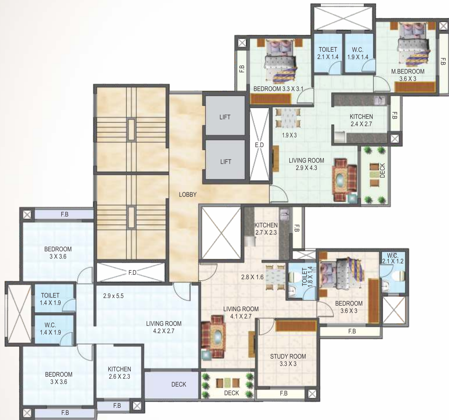
6TH, 9TH, 12TH & 15TH FLOOR PLAN